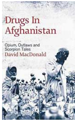
See larger image See Hi-Res Jpeg image